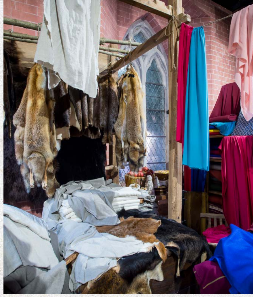
▲ Trading was conducted with goods that were typically regional, and sometimes with luxury goods: for example, wax and furs from Novgorod, cloth, silver, metal goods, salt, herrings and grain from Hanseatic cities such as Lübeck, Münster or Dortmund

Merchants, who often shared family ties to each other, were not always fair to producers and craftsmen. There is ample evidence of routine fraud and young traders in far-flung posts who led dissolute lives. It has also been proven that slave labor was used.